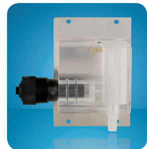
Constant Head Flowcell