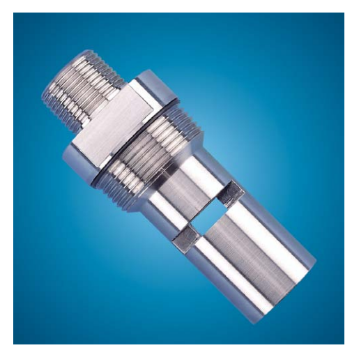
Gas Sensor / Generator Assembly