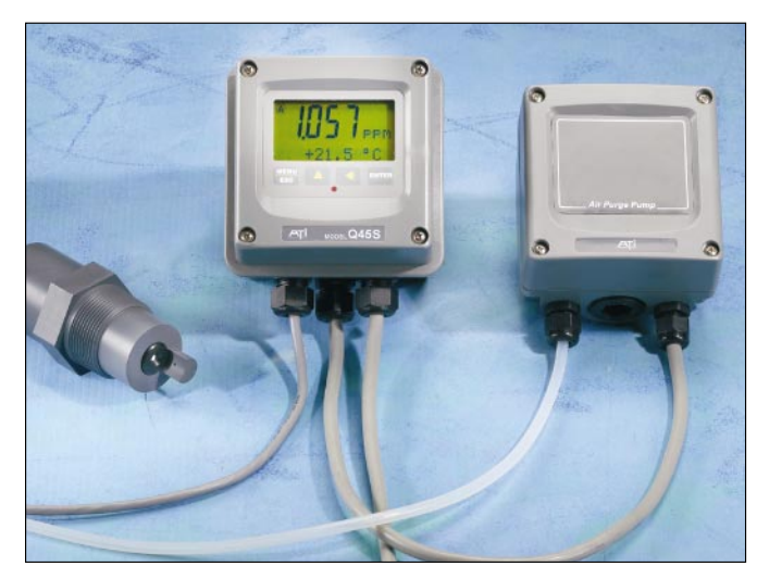
Q54S Monitor and Sensor

A special battery-powered version of the Q45S is available for use in temporary installations. This system runs on an internal 9 volt