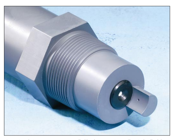
An optional air-purge system controlled by the transmitter will periodically deliver a blast of air across the critical sensor surfaces to remove water droplets.

battery and contains a data-logger for collecting information on existing air collection systems. A standard 9 volt battery will operate the unit for 4 days, while a 9 volt lithium battery will provide about 10 days of operation. Data is easily downloaded to a standard PC using software supplied with the unit.