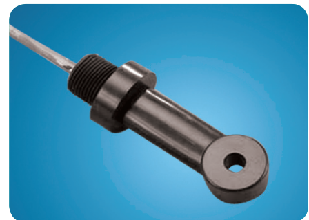
Noryl Toroidal Sensor